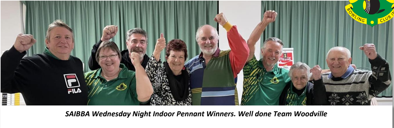
SAIBBA Wednesday Night Indoor Pennant Winners. Well done Team Woodville